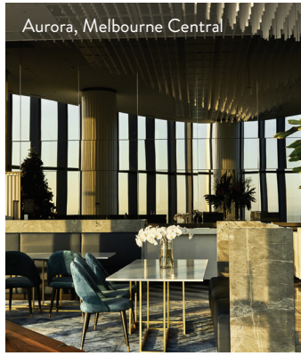
Aurora, Melbourne Central