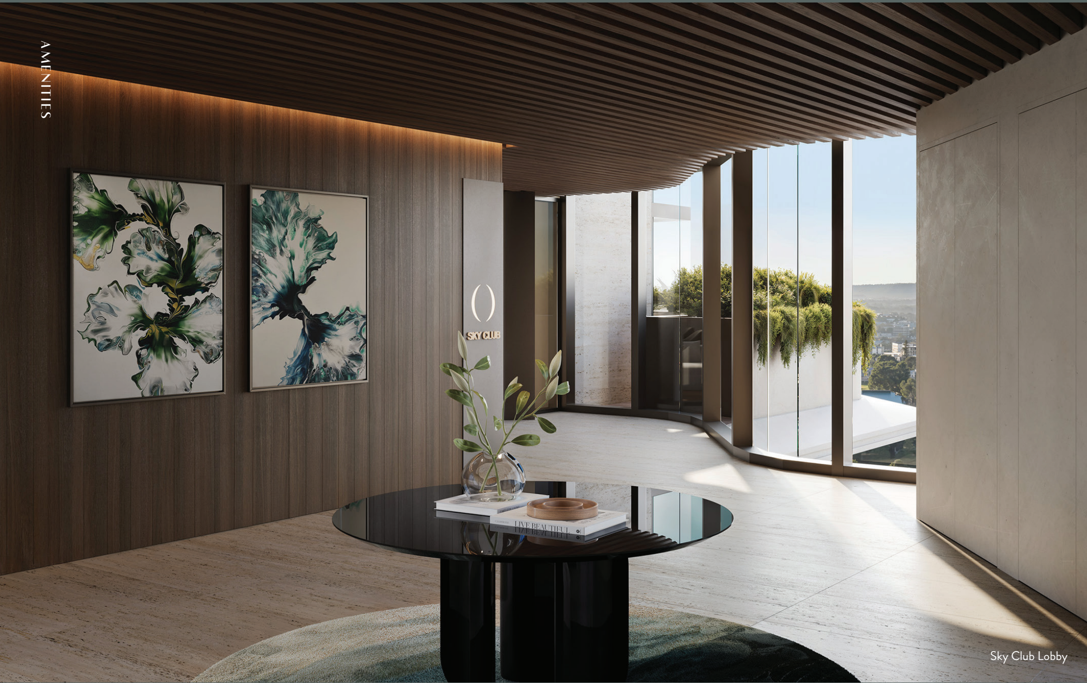
Sky Club Lobby