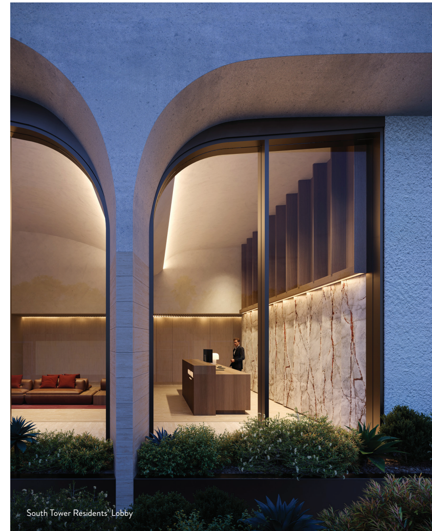
South Tower Residents' Lobby