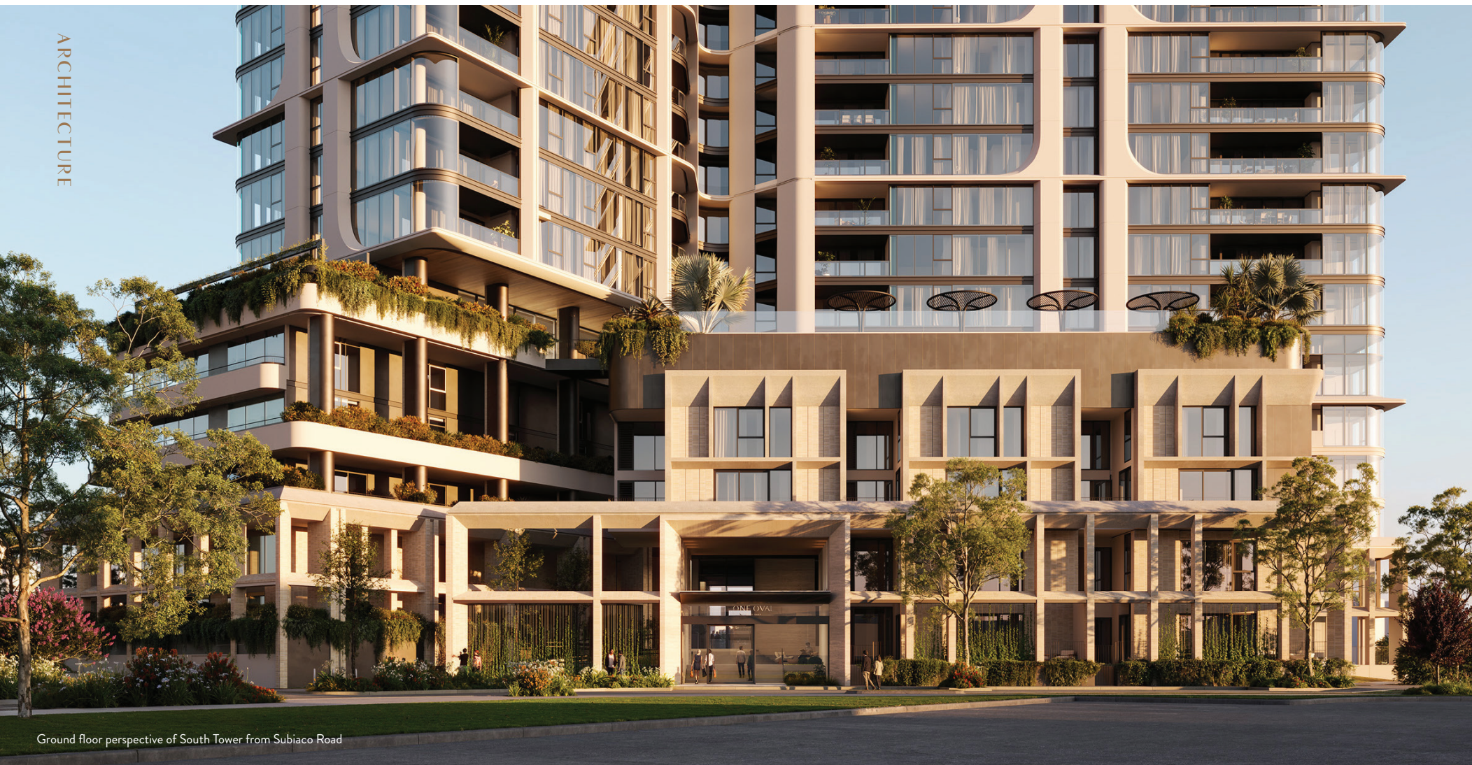
Ground floor perspective of South Tower from Subiaco Road