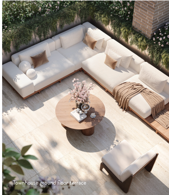
Townhouse ground floor terrace

The collection of townhouses at One Oval offers a light-filled and private way of living, with every residence designed to feel self-contained and independent. Generous layouts flow easily from indoors to out, creating bright spaces equally suited to everyday life and effortless entertaining.