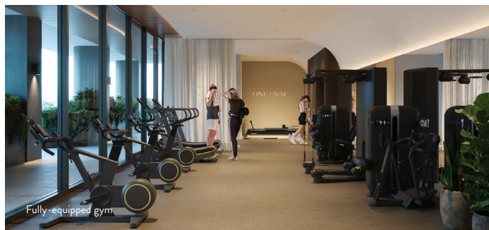
Fully equipped gym

The wellness offering includes a 25m lap pool, fully equipped gym, yoga and pilates zone, hot and cold plunge pool, steam room and sauna. These are complemented by quiet spaces designed for reflection and rest, creating an environment where health, relaxation, and renewal come together in harmony.